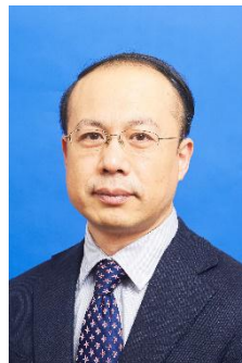
Interviewer: CHEN Zhimin

Former Prime Minister of Italy, Dean of the Paris School of International Affairs (PSIA) of Sciences Po Paris