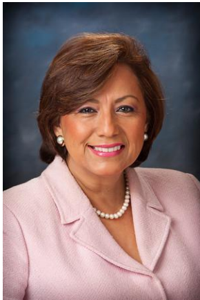
Rosario Marin 41st Treasurer of United States President, Marin & Marin LLC