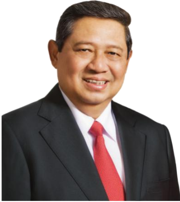
Susilo Bambang Yudhoyono The 6th President of the Republic of Indonesia