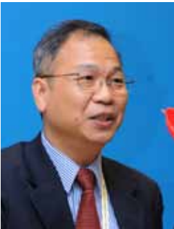
胡永泰 Wing Thye Woo

There's very careful concern for countries to engage in activities that are designed to secure their own energy future. It's completely understandable. But it's not a good outcome from the global point of view. What you really want, I think, is a price mechanism to be the main mediator of things in the global economy with respect to energy. And it's going to take multilateral cooperation to avoid the destructive parts of this gamble for energy security.