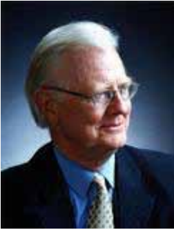
James A. Mirrlees

1996年诺贝尔经济学奖获得者 1996 Nobel Laureate in Economics